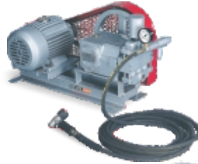
P 36/30 ▲