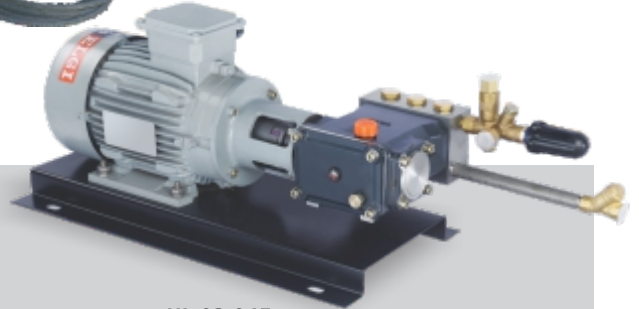
HL 03 045 New Gen TPP ▲